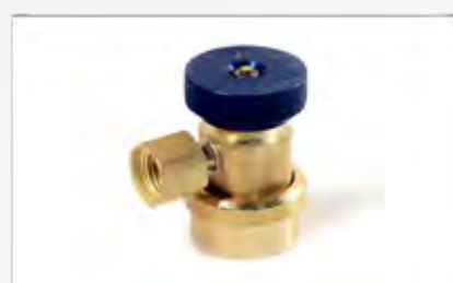
AEK208B Quick coupler LP R134a