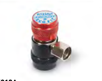
AEK218A HP "puff free" coupler for HFO