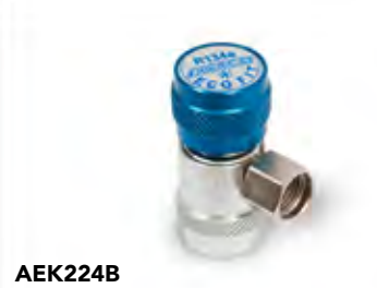
LP "puff free" coupler for R134a