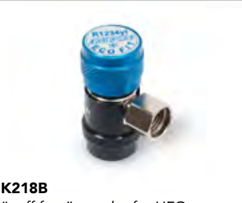
■ AEK218B LP "puff free" coupler for HFO