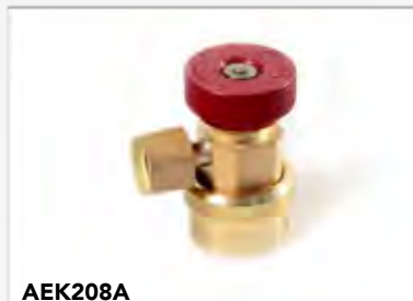
Quick coupler HP R134a