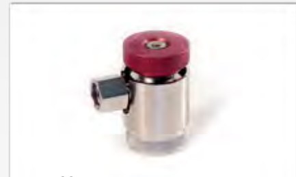
AEK1234A Quick coupler HP HFO