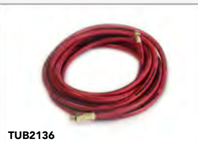
Red hose 6 mt HFO