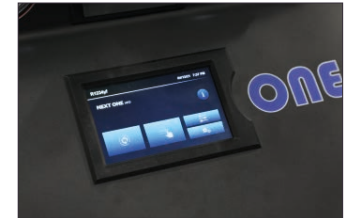
COLOR TOUCH SCREEN