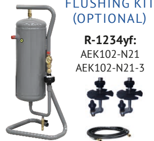
FLUSHING KIT (OPTIONAL)