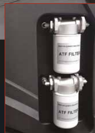
2 ULTRA FINE FILTERS