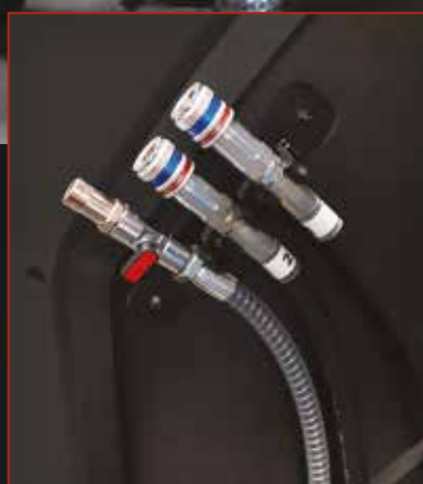
2 CONNECTORS AND USED OIL DRAIN HOSE