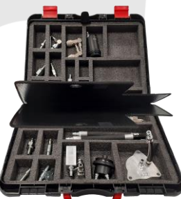
New ATF advanced kit adapters KIT.ATF.ADV and storage suitcase for adapters ATF.CASE

Please see the updated catalogue available online for more information .